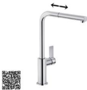
FL96127CR Flag sink mixer Height: 319 mm Projection: 211 mm