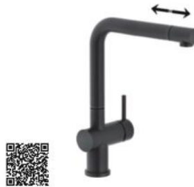
LV00113BM Live sink mixer Height: 310 mm Projection: 318 mm