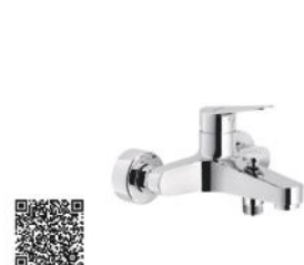
BS101110/1CR Blues Bath & Shower Mixer L170 x W150 mm