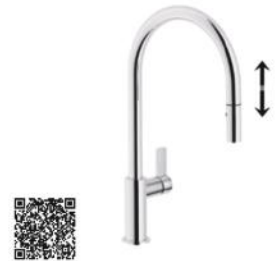
FL96137/1CR Flag sink mixer with 2-jet Height: 370 mm Projection: 195 mm