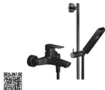
VV103110BM + AD140/51RBM Acquaviva bath & shower mixer, hand shower, shower holder, 550mm rail (centre to centre distance) L178 x W150 mm