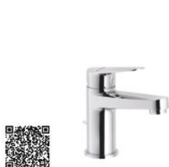
BS101118/1CR Blues basin mixer L110 x W48 x H140 mm