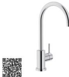
LV00133CR Live sink mixer Height: 355 mm Projection: 185 mm