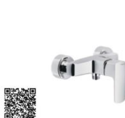
VV103130CR Acquaviva shower mixer L136 x W150 mm