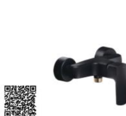
VV103130BM Acquaviva shower mixer L136 x W150 mm