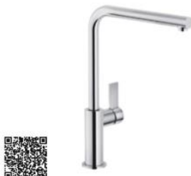
FL96133CR Flag sink mixer Height: 319 mm Projection: 220 mm