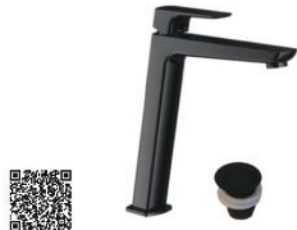
VV103128/2BM Acquaviva high basin mixer L212 x W49 x H267 mm