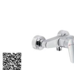
BS101130CR Blues Shower Mixer L138 x W150 mm