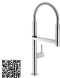
MV92300/50CR Move sink mixer Height: 460 mm Projection: 183 mm