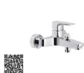
VV103110/1CR Acquaviva bath & shower mixer L178 x W150 mm