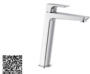
VV103128/2CR Acquaviva high basin mixer L212 x W49 x H267 mm