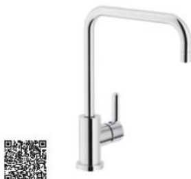
AB87134N4CR ABC sink mixer Height: 325 mm Projection: 235 mm