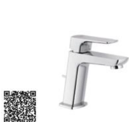
VV103118/1CR Acquaviva basin mixer L117 x W49 x H152 mm