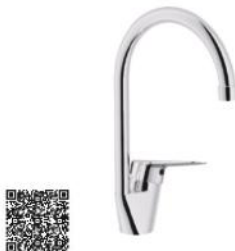
BS101113ACMECR Blues sink mixer Height: 315 mm Projection: 215 mm