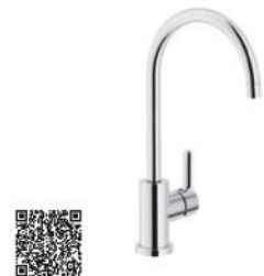
AB87133N4CR ABC sink mixer Height: 355 mm Projection: 180 mm