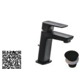
VV103118/1BM Acquaviva basin mixer L117 x W49 x H152 mm