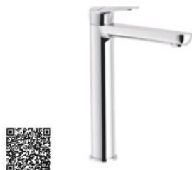
SA99128/2-BSCR Blues high basin mixer L194 x W50 x H290 mm